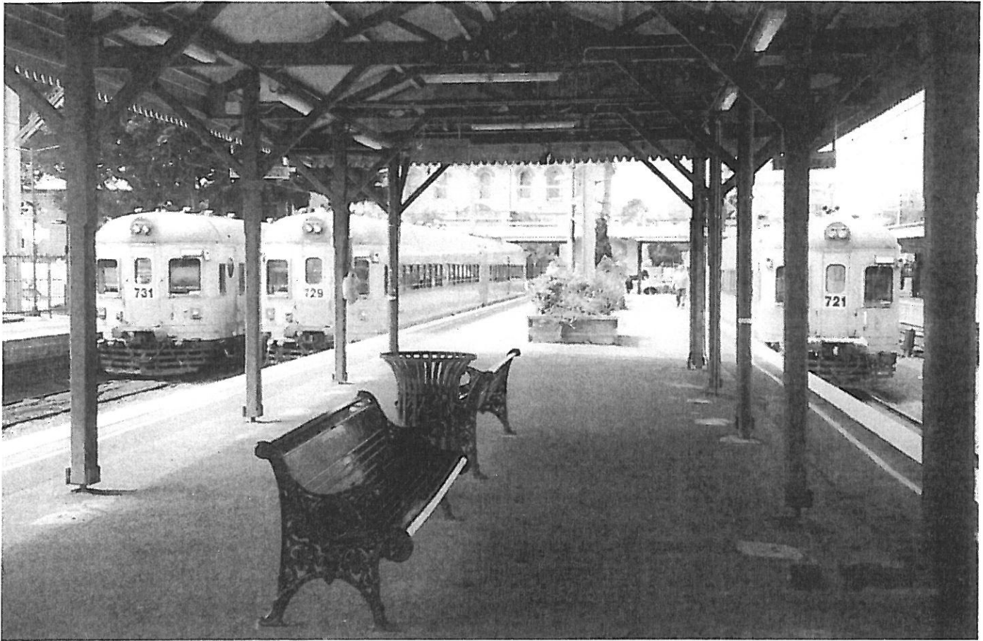
620 Units, 731, 729 and 721 along with their respective trailer/power cars sit in Newcastle platform. Date 19th march 2006