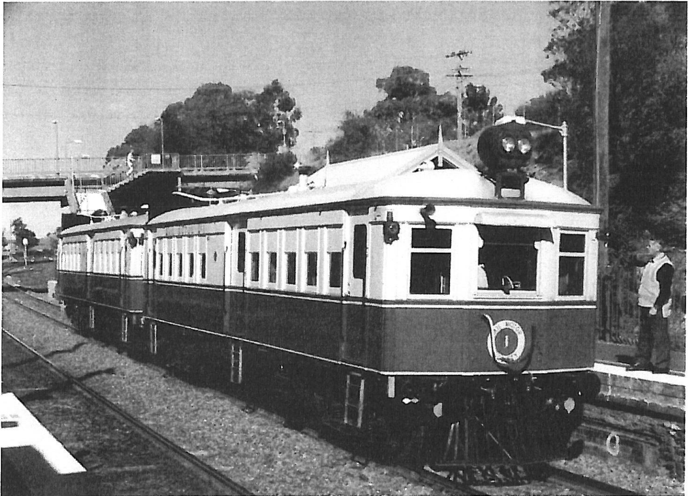
CPH 1 & 7 at Picton Railway Station during a tour down south. Date not known.