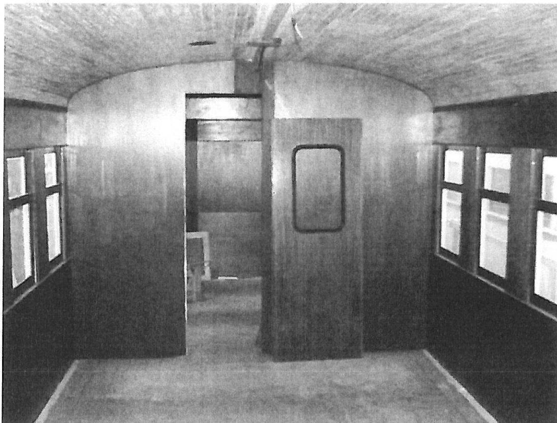
Middle compartment of CTC 51 looking towards the blanked end