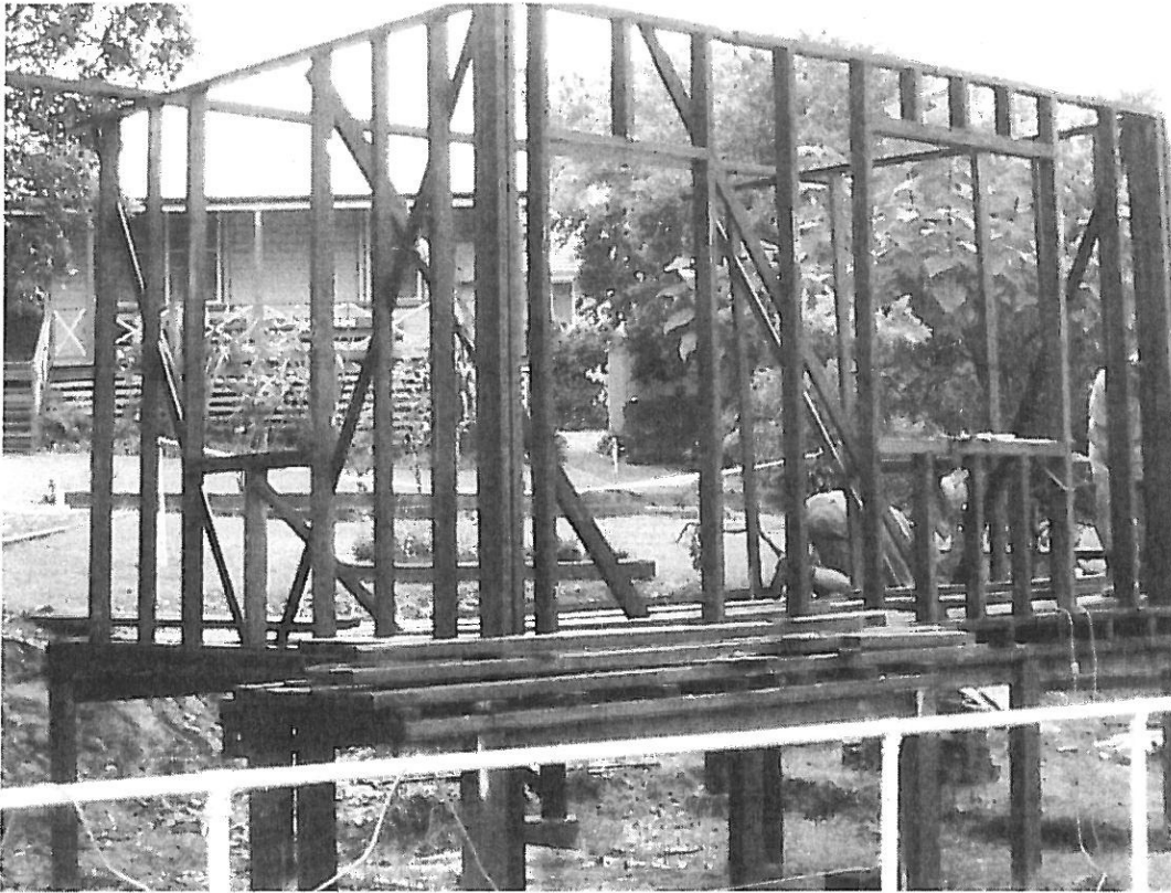
The timber frame of the signalbox is being erected by Shane Blatchford