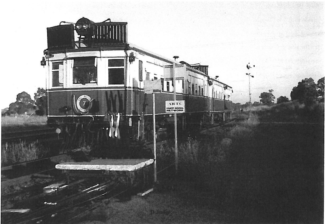
CPH 7 & CPH 1 stand at Gulgong Jct prior to coming of the Mudgee Branch on the 19th November 2005