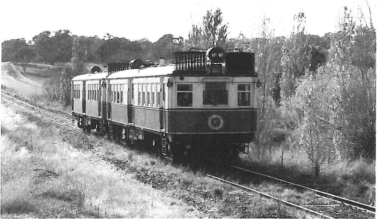
CPH 7 & CPH 1 nearing Manduramah on the 8th May 2006.