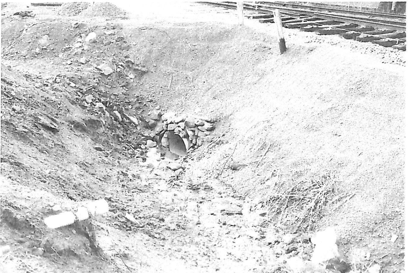
Top Photo: Work on the drainage began with preparation of the pipe and drain walls. 29th March 2008