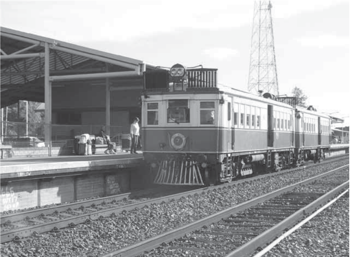
In the shadow of the ARTC communications tower CPH's 7 and 1 stand at Grafton City ready to retrace their path south to Telarah. Grafton City which was traditionally known as South Grafton is the location of the Grafton area CountryLink station and is located immediately south of the impressive Clarence River bridge. While all passenger trains stop at this location Grafton's main rail yard is located on the north side of the river.