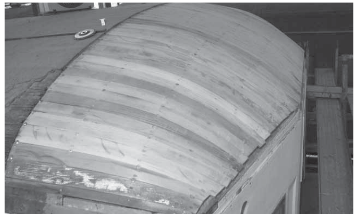
Completed roof above driver's cab CTC 51.