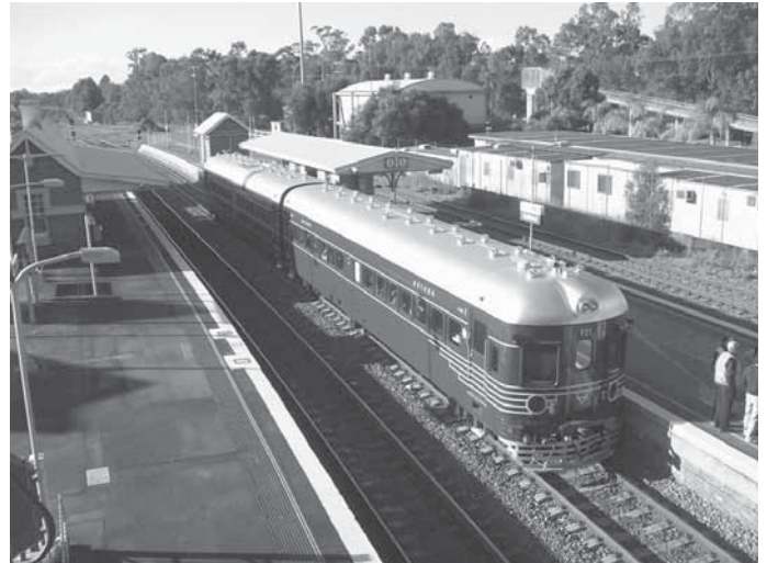
With most passengers already on board 721/621 gleams in the morning sunshine as the train crew gather on Maitland's platform 4 and conduct their trip discussions. Soon the outing north will begin.