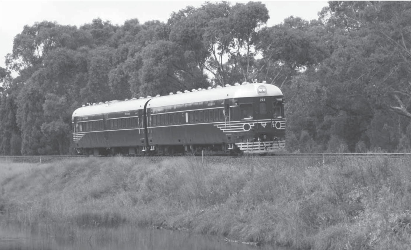
Popular touring set 621/721 during ARTC inspection duties near the former location of Barbigal.