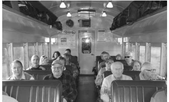
Passengers on 721 enjoying the journey.

On Sunday 13/06/10 set 621/721's journey to Armidale is interrupted as it stands during the lunch stop at the well presented Tamworth station on day 3 of the ARHS North West Circle Tour. Operations on the GNR is today truncated at Armidale and beyond West Tamworth is only trafficked by the daily Northern Tablelands Xplorer service and the odd inspection train. A huge contrast from the glory days of this important trunk route which was once the main link for passengers and produce to and from Queensland.