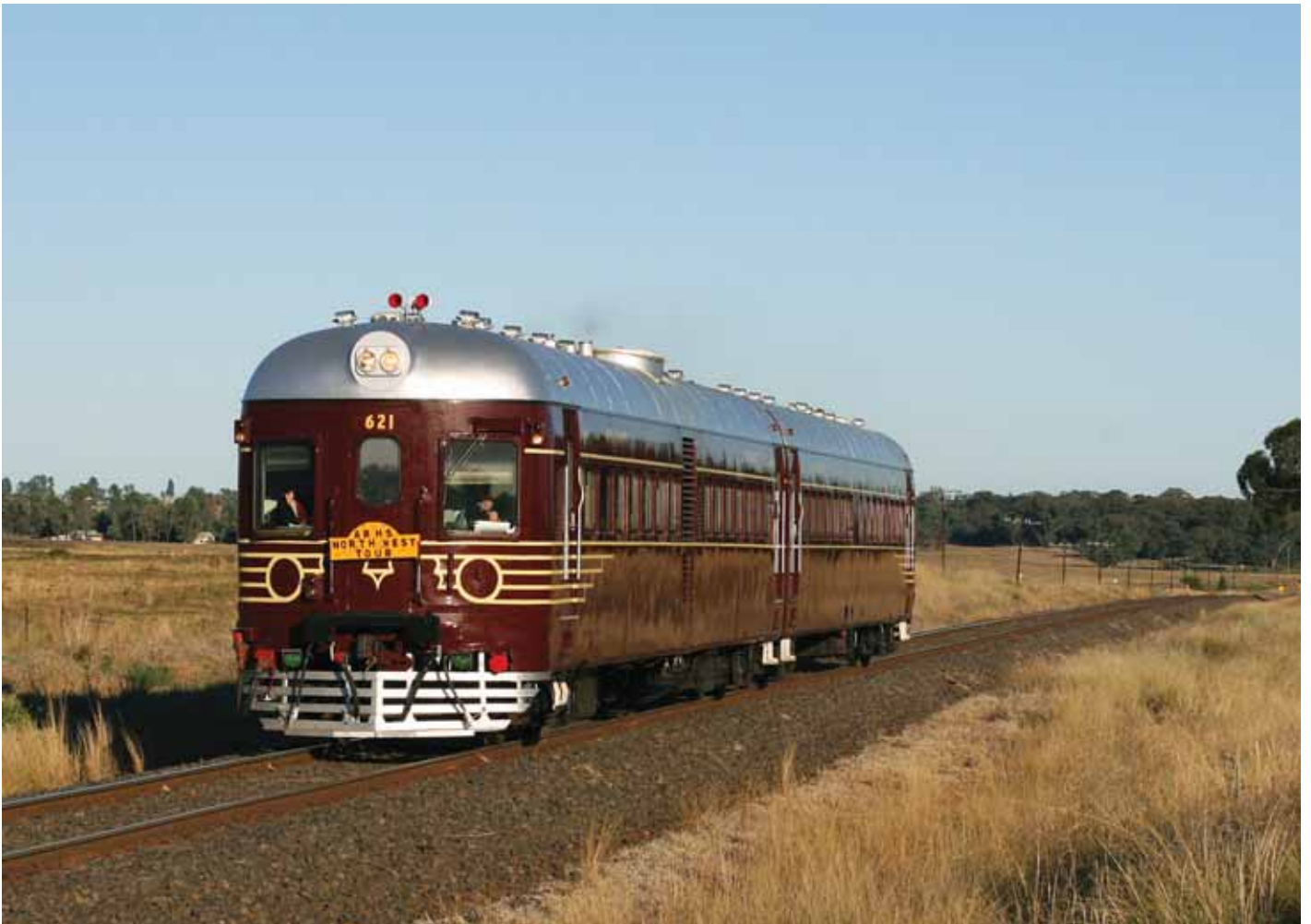
Sprinting in open country 621/721 makes a fine sight as it passes through Plains Creek on its way to Elong Elong and the eventual day two destination of Narrabri.

Unlike the usual long weekend tour by the Rail Motor Society, the CPH's were unavailable so set 621/721 were substituted. These proved most successful in negotiating the itinerary and were more comfortable, the catering by the Society's volunteer staff was greatly appreciated over the four days of travel in covering the distance of 1209 kilometres. There were three overnight stops scheduled at Dubbo, Narrabri and Armidale where the accommodation and catering varied.