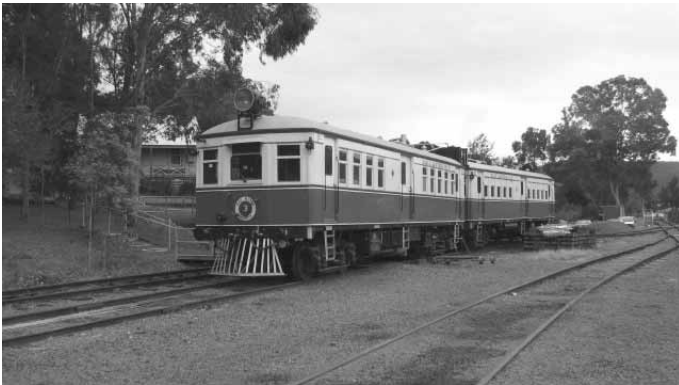
CPHs 3 and 7 on No.2 road during shunting to rearrange vehicles in the shed on July 7.

A licensed electrician has been contracted to install additional lighting and power points in the shed and also the FZ amenities car.