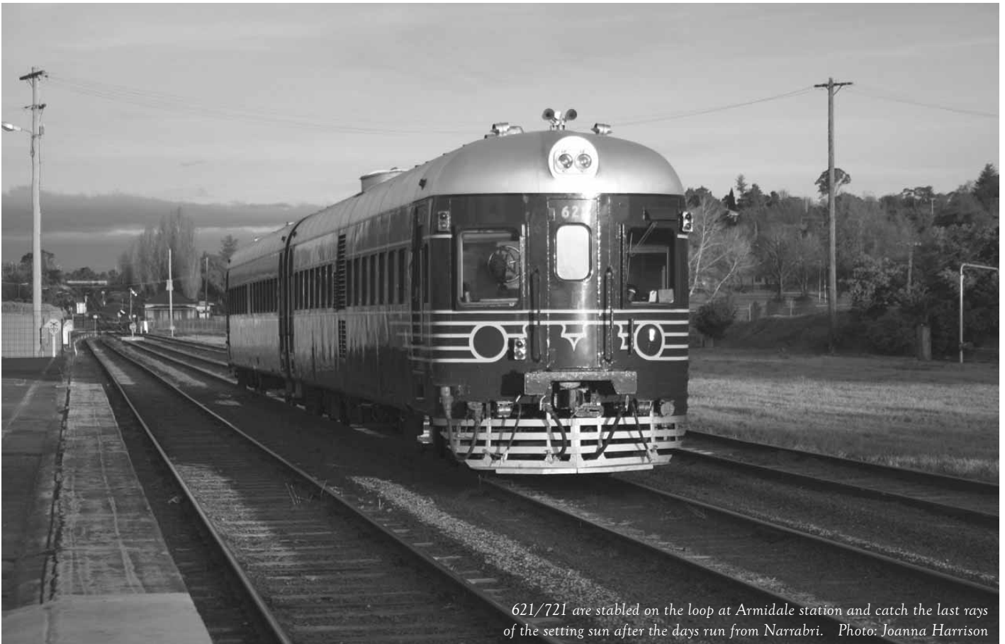
621/721 are stabled on the loop at Armidale station and catch the last rays of the setting sun after the days run from Narrabri.