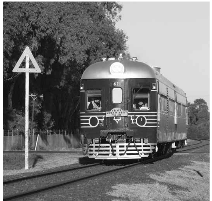
Saturday's journey of the June long weekend North West Circle tour has just commenced as 621/721 passes the Troy Junction landmark and leaves Dubbo behind on its way to the north.