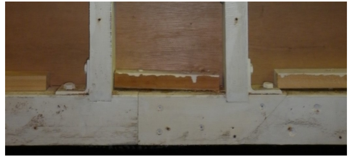
An example of the short stud bolts found on CTC 51 that required longer bolts

The carriage crew has attended to CTC 51 (trailer car) by rectifying a potential structural weakness that was a cause for concern last year. They have securely fixed the wall studs to the bearer by installing longer bolts as well as addressed other shortcomings. The plywood side cladding has been reattached and secured in place. Work will now turn to the undercarriage.