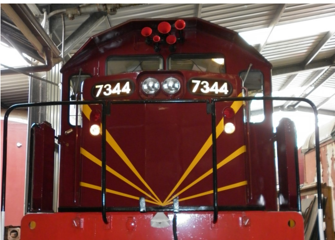
New illuminated number boards being tested

The small oil leak on the turbocharger has been fixed.