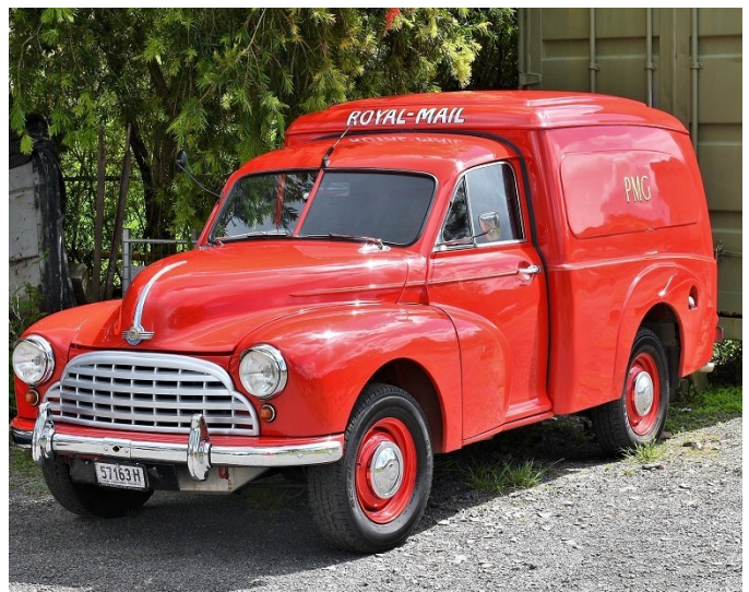
A superbly detailed historic Morris van in the carpark (Open Day 21 Feb)