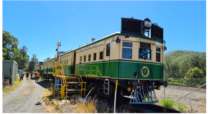
Public Open Day, 17 Jan 2021